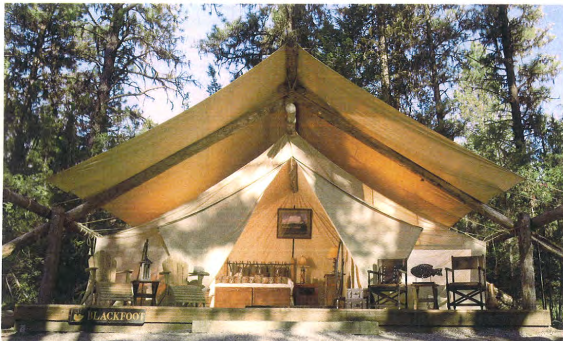
Cowboy Comforts: One of the new safari-style, couples-only tented suites at the Ranch at Paws Up. Below: the Lodge at the just-opened Brush Creek Ranch

Recently, the landscape that launched a thousand cowboy fantasies has gone luxe, with a spectacular new crop of dude ranches. Thurston Erickson rounds up the best of the West.