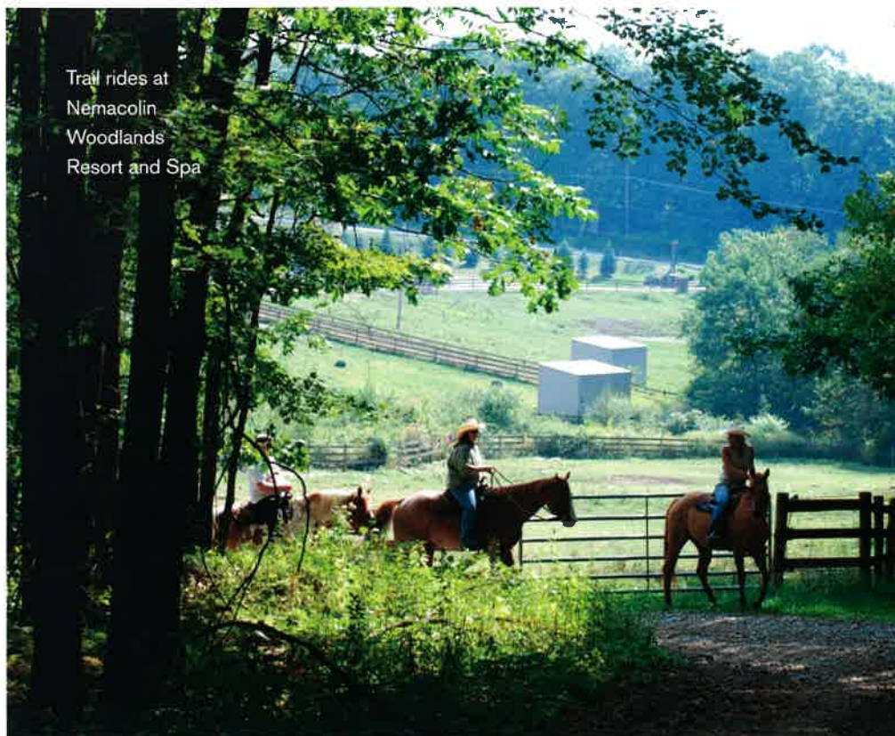
Trail rides at Nemacolin Woodlands Resort and Spa