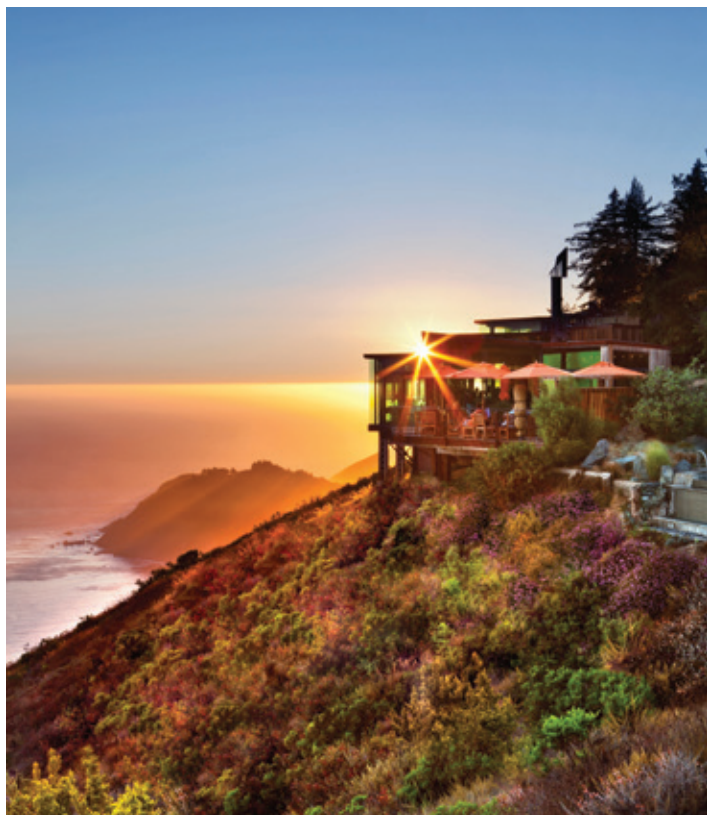
ABOVE: PHOTO BY KODIAK GREENWOOD